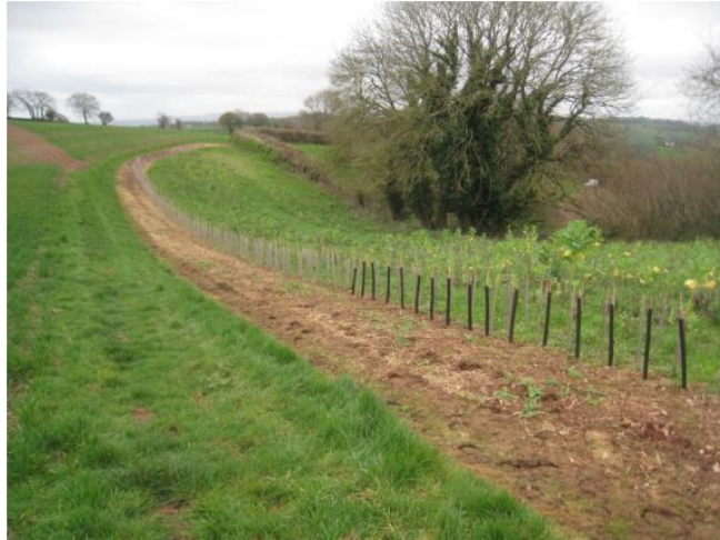
Cross-slope hedgerow planted on a raised bank to intercept field runoff from the field above