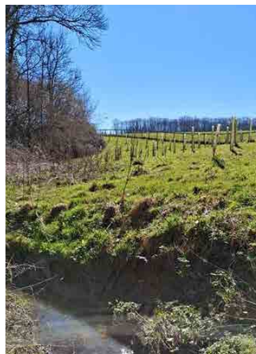
Tree planting alongside watercourses