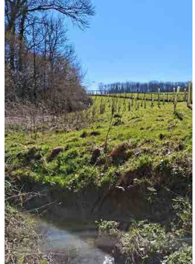
Tree planting alongside watercourses