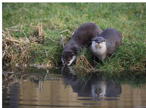
Bleadon Levels Nature Reserve (North Somerset)

Thank you for being a member of our online panel and for taking part!